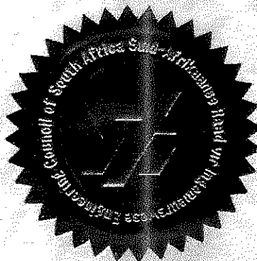
Chief Executive Officer